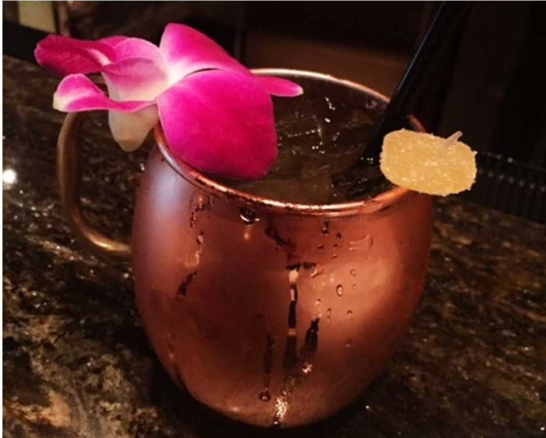
Beating the heat

WEDNESDAY, DECEMBER 21, 2016 AT 8:16 A.M.